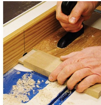
Screw a handle similar to a plane tote onto a jig to keep your hand from slipping into danger. About $11, item 30876, Rockler.