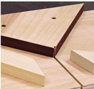
Self-adhesive sandpaper on this miter jig prevents slippage. About $17 for 2½"x30' roll, various grits, item 68Z72.01, Lee Valley.

When you need a jig surface that resists slipping and sliding, high-friction tape fits the bill. It's similar to the pads that keep cell phones from sliding off car dashboards. The tape's adhesive backing makes it easy to attach to jig faces. Apply it to the fence of a sliding cutoff table, for instance, so the workpiece won't creep. Or, use it to make a nonskid back on a straightedge guide for a router or circular saw.