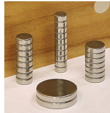
Epoxy round rare-earth magnets into blind holes in a jig. Putting them into steel mounting cups increases magnetic pull.