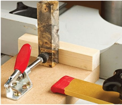
The horizontal toggle clamp on this jig safely and securely holds a small workpiece against a notched fence for drilling .