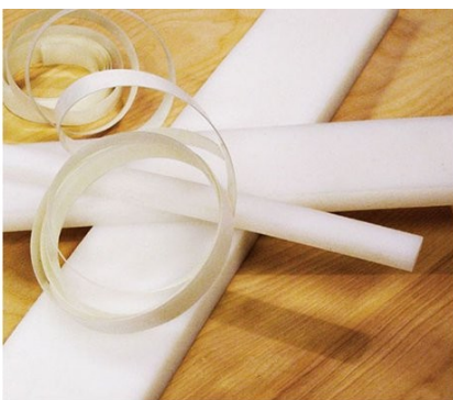
Slippery UHMW polyethylene comes as solid stock in many shapes and sizes or as self-adhesive tape. It's ideal for sliding jig bases or fence faces.

To simplify positioning a workpiece precisely on a jig or setting an adjustable stop, apply a self-adhesive measuring tape directly to the jig. Made of steel, heavy paper, or plastic, these tapes have a PSA (pressure-sensitive adhesive) backing, and are available in either left- or right-reading versions with English or metric scales. To allow easy centering, as well as accurate measurements in both directions from a point, such as a drill-press chuck or mortising bit, apply left- and right-reading tapes so they meet at the reference point.