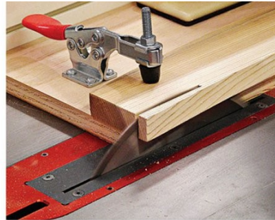
A vertical toggle clamp holds the workpiece firmly in place on this sled. The foot adjusts up or down to change tension or clamp thinner material.