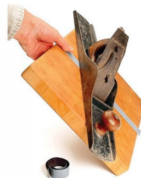
High-friction tape adds grip to a surface to prevent slipping without bonding or clamping. About $5 for 1x12", item 99K34.01, Lee Valley.