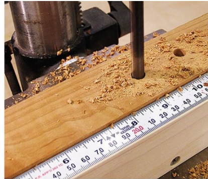
A self-adhesive measuring tape attached to a jig simplifies adjustment and work positioning. Tapes read left-to-right or right-to-left.