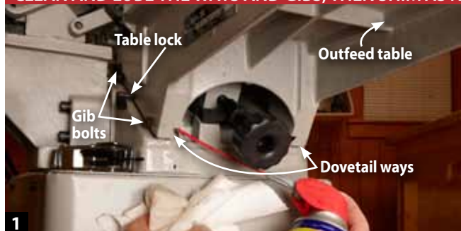
1 Loosen the gib bolts and table lock. Direct WD-40 or a similar solvent between the dovetail ways on both sides to dissolve the old grease.