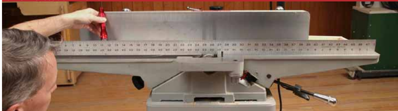
Shine a flashlight behind a straightedge to highlight gaps that require you to make adjustments.