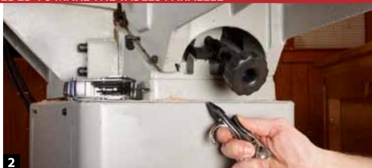
2 Lift the end of the table to allow the solvent to reach all areas. Force out any remaining grease and grime with compressed air.