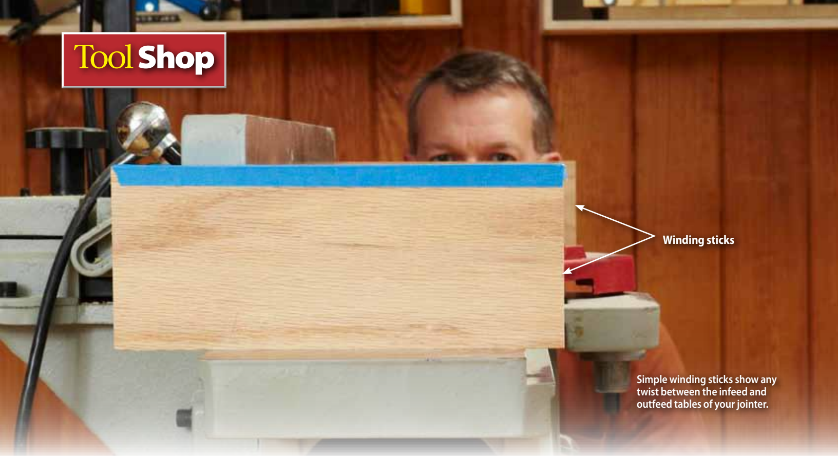
Simple winding sticks show any twist between the infeed and outfeed tables of your jointer.