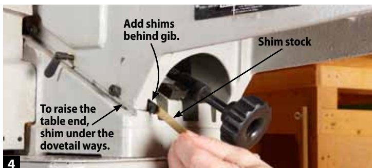
4 Cut .005 brass shim stock ( Source ) as long and wide as the gib, grease the shim, and slide it behind the gib. Add additional shims if needed.

the table to the cutterhead. This can be a tedious trial-and-error process; you'll make an adjustment, retighten screws, recheck the table alignment, and then repeat the process if needed.