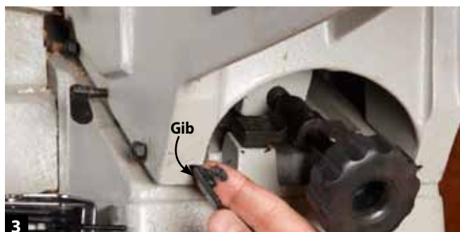
3 Slide the gibs (metal bars between the dovetail ways) out partially and apply a liberal coat of lithium soap grease; then reinsert them.